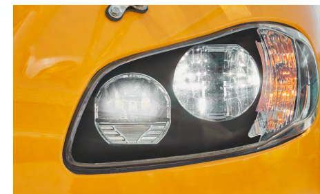
New LED light option increases efficiency, brightness and longevity reducing your TCO.