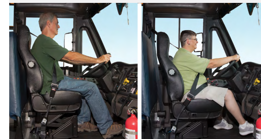
Optional tilt and telescoping steering wheel and optional adjustable pedals give drivers of all sizes the comfort they deserve.